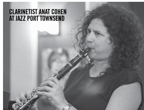
CLARINETIST ANAT COHEN AT JAZZ PORT TOWNSEND

Camp is Eastside High School Camp: July 15-18; Middle School Camp (open to all incoming 7-9th grade students): July 22-25; High School Camp (open to all incoming 9-12th grade students): July 29-August 1.