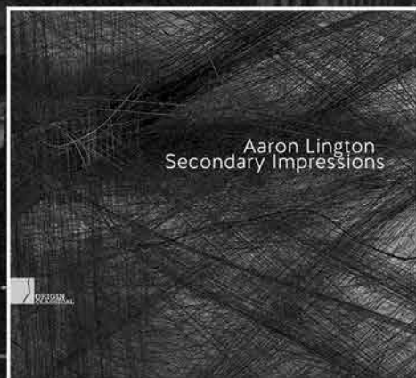
AARON LINGTON Secondary Impressions